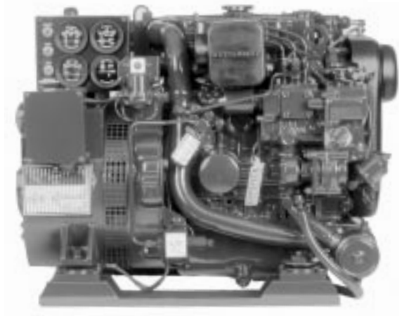
4BCD Diesel Generator

The 4BCD is backed by Westerbeke's 5-year limited warranty. The presence of Westerbeke in over 65 countries around the world provides customers with easy access to parts, service and technical support worldwide. Established in 1937, Westerbeke is committed to providing its customers with quality products and unequaled after sales support.